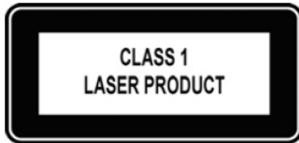
Figure 1. Class 1 laser product tag