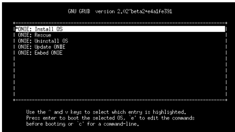
Figure 4. ONIE install menu

The system comes up in ONIE Install mode by default, as shown: