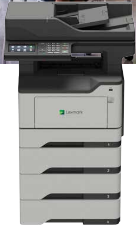
MX522adhe with optional trays