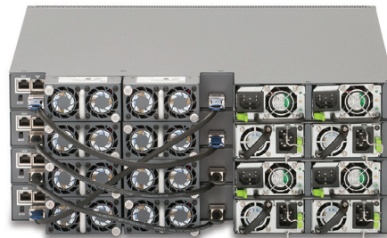
Figure 1. ERS 5900 stack back view with stacking cables, fans and power supplies

the backbone. In addition to the stacking cables, a return cable is also used to protect against any port, unit or cable failures.