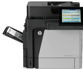
HP LaserJet Enterprise MFP M630dn

Rely on a full-featured HP Enterprise Flow MFP that streamlines digital workflow with advanced HP Flow solutions, safeguards business data and documents with a robust suite of top-flight security features and offers simple, efficient mobile printing.