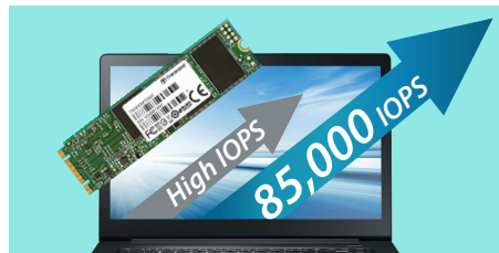
Built-in SLC caching technology

Utilizing the SATA III 6Gb/s interface, Transcend's ultracompact M.2 SSDs are well-suited to address the high-performance needs and strict size limitations of small form factor devices. By using only high-quality flash chips and enhanced firmware algorithms, Transcend's M.2 SSDs deliver peerless reliability.